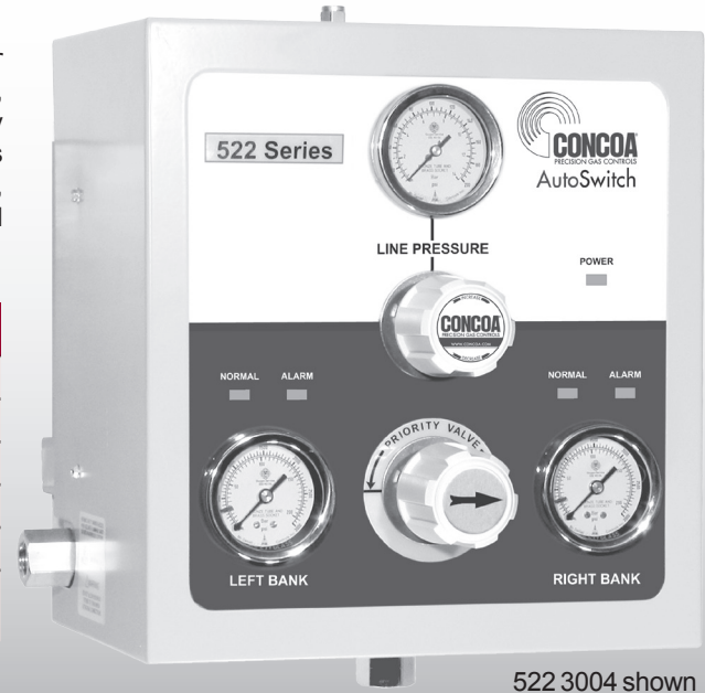
522 3004 shown