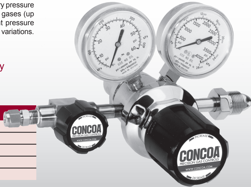
212 2331-580 shown