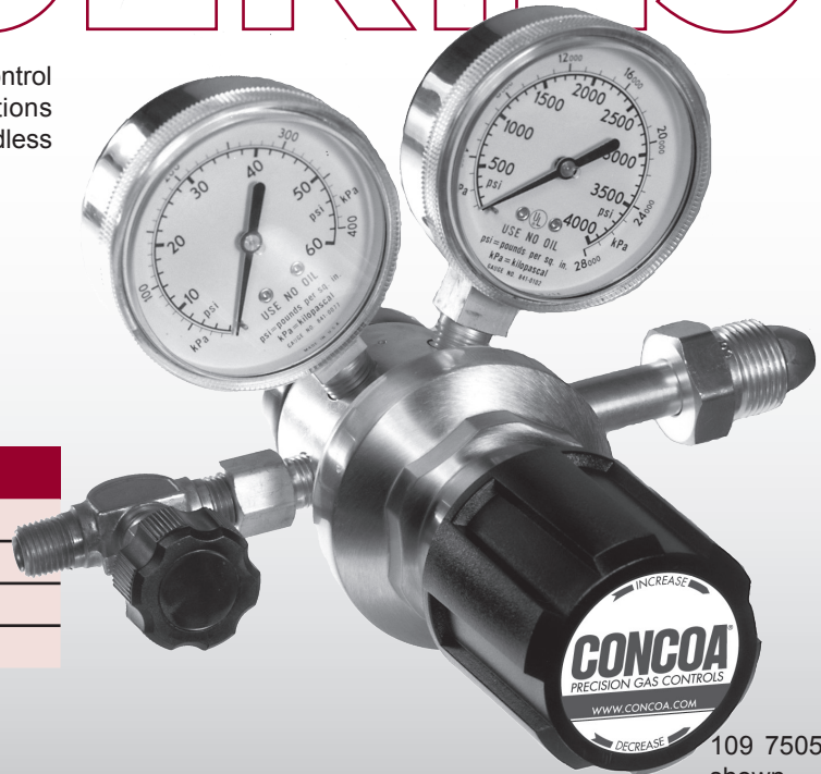
109 7505-580 shown