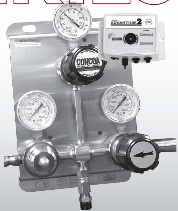
515 4111 shown with attached flexible hoses. Available with optional remote alarm.

The 515 Series SilcoNert 1020 is an automatic switchover system designed to deliver a continuous supply of reactive, corrosive, or high purity gases for calibration, instrument support, or process, control. The proprietary amorphous Silicon surface finish provides extreme inertness and corrosion resistance over 316L stainless steel. To maintain constant downstream pressure, an integral line regulator option is available.