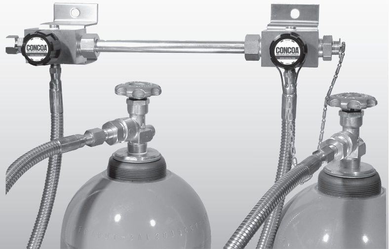
52B 1232 shown

The 52B, 52C and 52S Series Maniflex are modular gas distribution systems that may be connected to regulators, dual regulator switchovers, IntelliSwitch and AutoSwitch systems. A modular gas distribution system allows the user to size the inlet capacity of a system so that cylinder changes will not be as frequent. The Maniflex system provides the user with the capability of purchasing an unlimited number of manifold stations connected to a single header. The Maniflex headers themselves may be purchased as a complete system (unassembled) or as individual components.