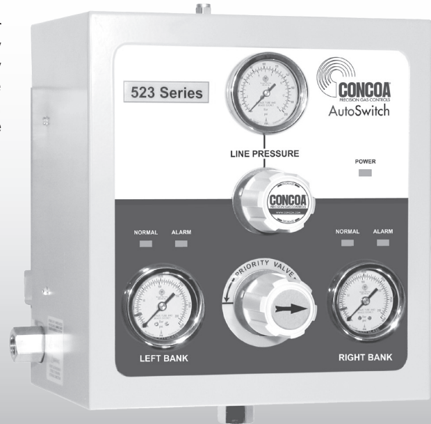
523 3004 shown