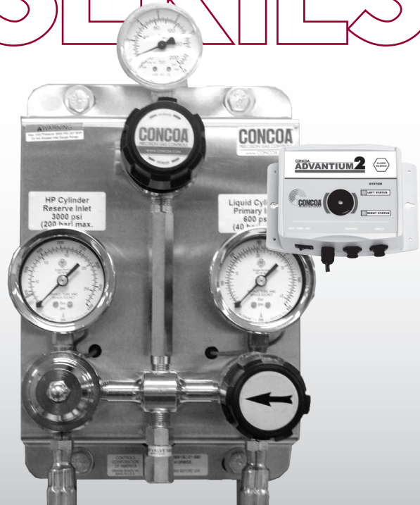
526 C03B shown with attached flexible hoses. Available with optional remote alarm.

The 526 LC Series is an automatic switchover system designed to continuous supply high purity gas from a primary cryogenic source and backup high pressure cylinders. The system comes with options for flexible hoses or manifold connectors for the high pressure side for multiple cylinders. Due to flow and pressure limitations from a cryogenic sources the system has only three switching options that are matched to the three relief valve settings for cryogenic liquid cylinders.