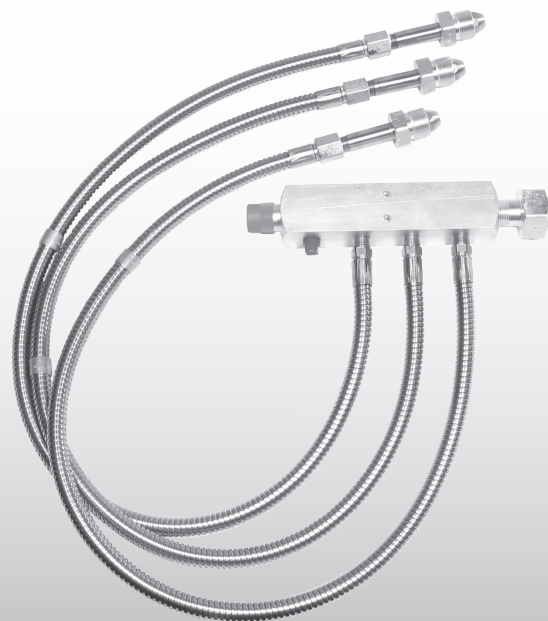
52L 1053-580 Shown